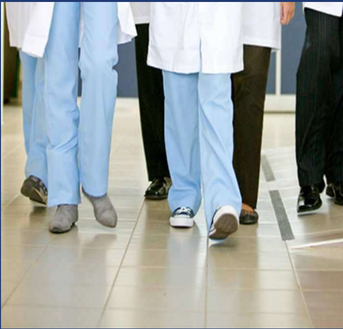
Trousers 100 % Cotton, PC, CVC FDA, CE Approved