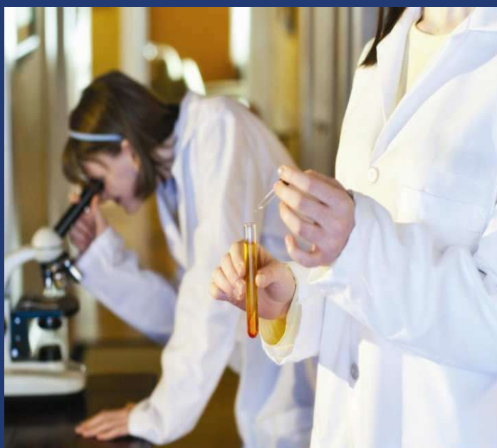
Lab Coats 100 % Cotton, PC, CVC FDA, CE Approved