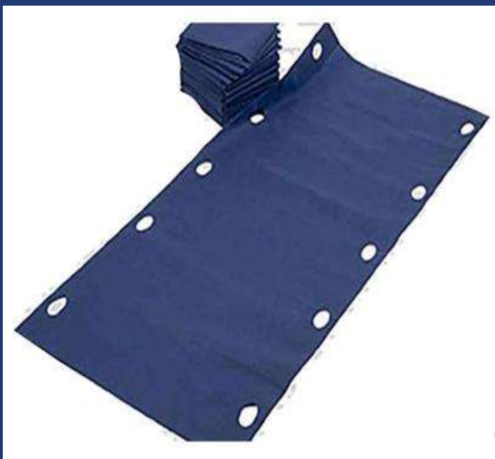
Draw Sheets 100 % Cotton, PC, CVC FDA, CE Approved