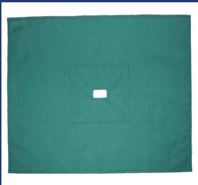
Surgical Drape Sheets 100 % Cotton, PC, CVC FDA, CE Approved