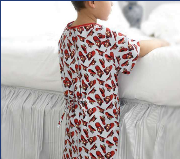
Babies Textile 100 % Cotton , PC, CVC FDA, CE Approved