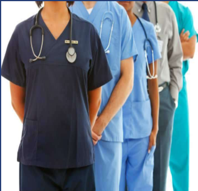
Scrubs 100 % Cotton, PC, CVC FDA, CE Approved