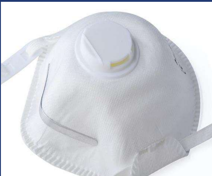
Dust Mask With / Without Valve FDA, CE Approved