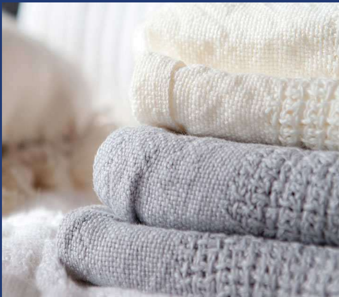
Thermal Blankets 100 % Cotton, PC, CVC FDA, CE Approved