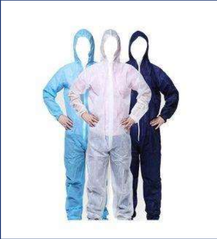
Tyvek Coverall Sizes S/M/L/ XL. Multiple GSM FDA, CE Approved