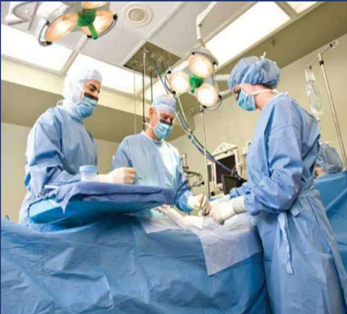
Surgical Gowns Woven / Non Woven FDA, CE Approved