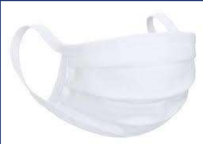
Non Medical Cotton Face Mask 100 % Cotton / PC / CVC. Single / Double Layer With or Without Non Woven layer