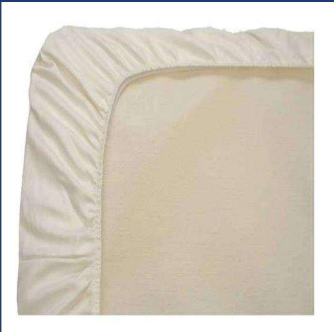
Fitted Sheets 100 % Cotton, PC, CVC FDA, CE Approved