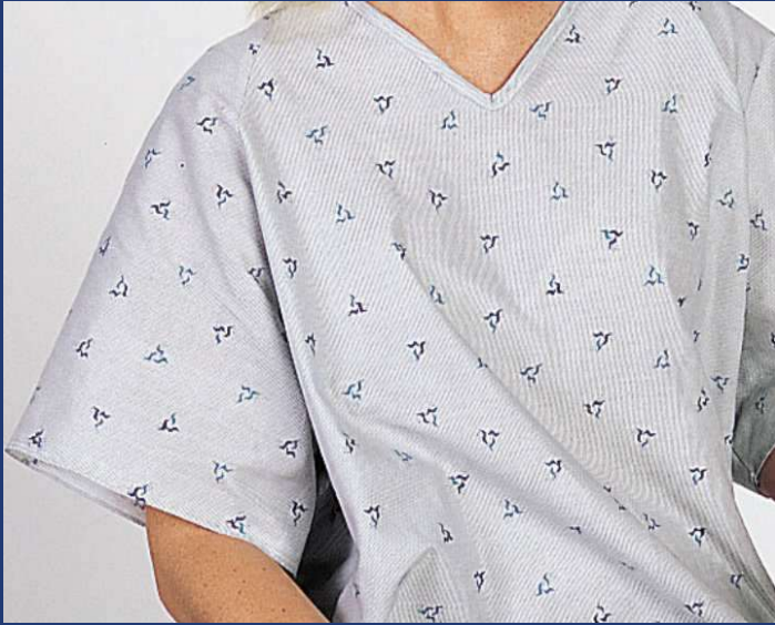
Patient Gowns 100 % Cotton , PC, CVC FDA, CE Approved