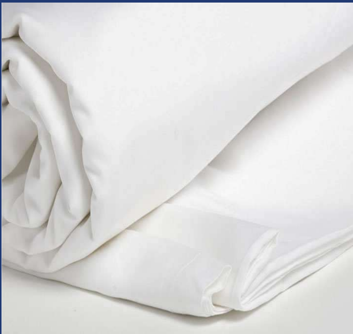
Duvet Covers 100 % Cotton, PC, CVC FDA, CE Approved