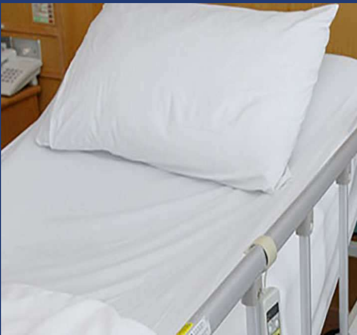
Hospital Bed Sheets 100 % Cotton, PC, CVC FDA, CE Approved