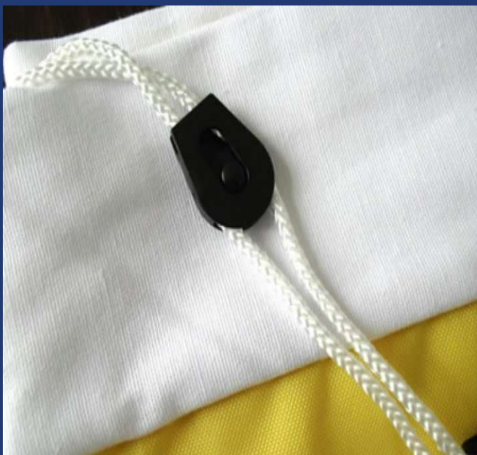
Laundry Bags 100 % Cotton, PC, CVC FDA, CE Approved