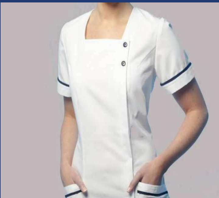
Nursing Uniforms 100 % Cotton , PC, CVC FDA, CE Approved